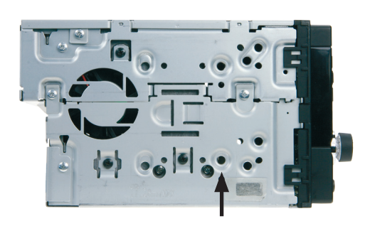
Mount the metal brackets with the double DIN head unit