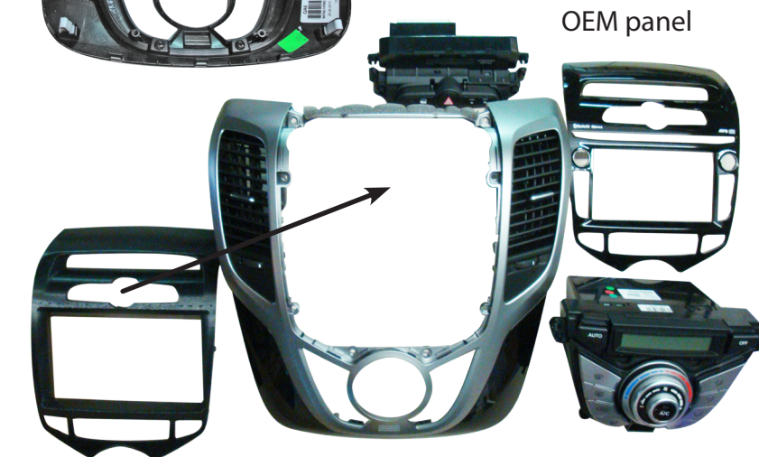
new facia plate