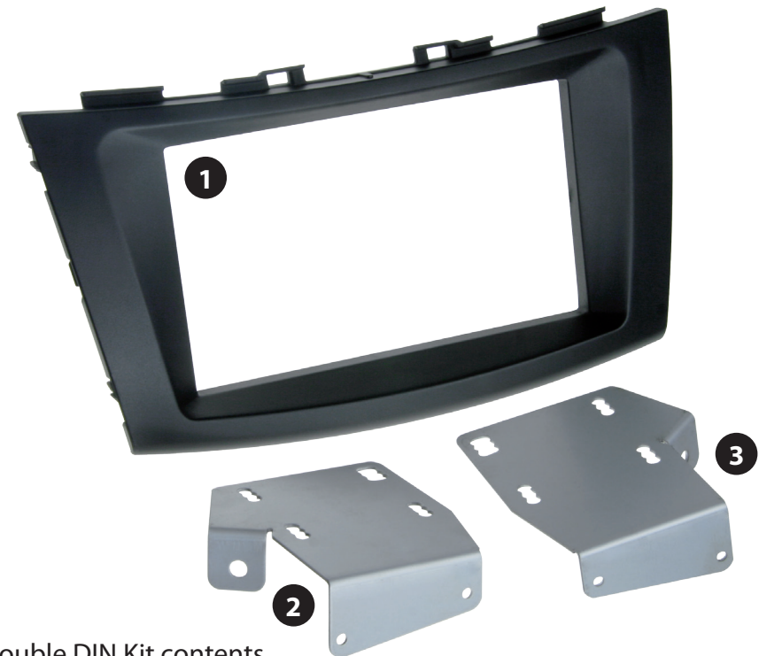
Double DIN Kit contents